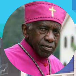
Archbishop Ndingi Mwana a Nzeki