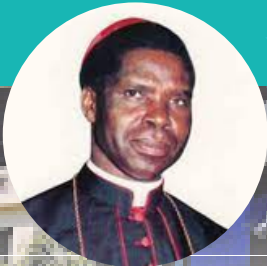
The Servant of God, Maurice Cardinal Otunga