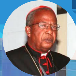
His Eminence John Cardinal Njue